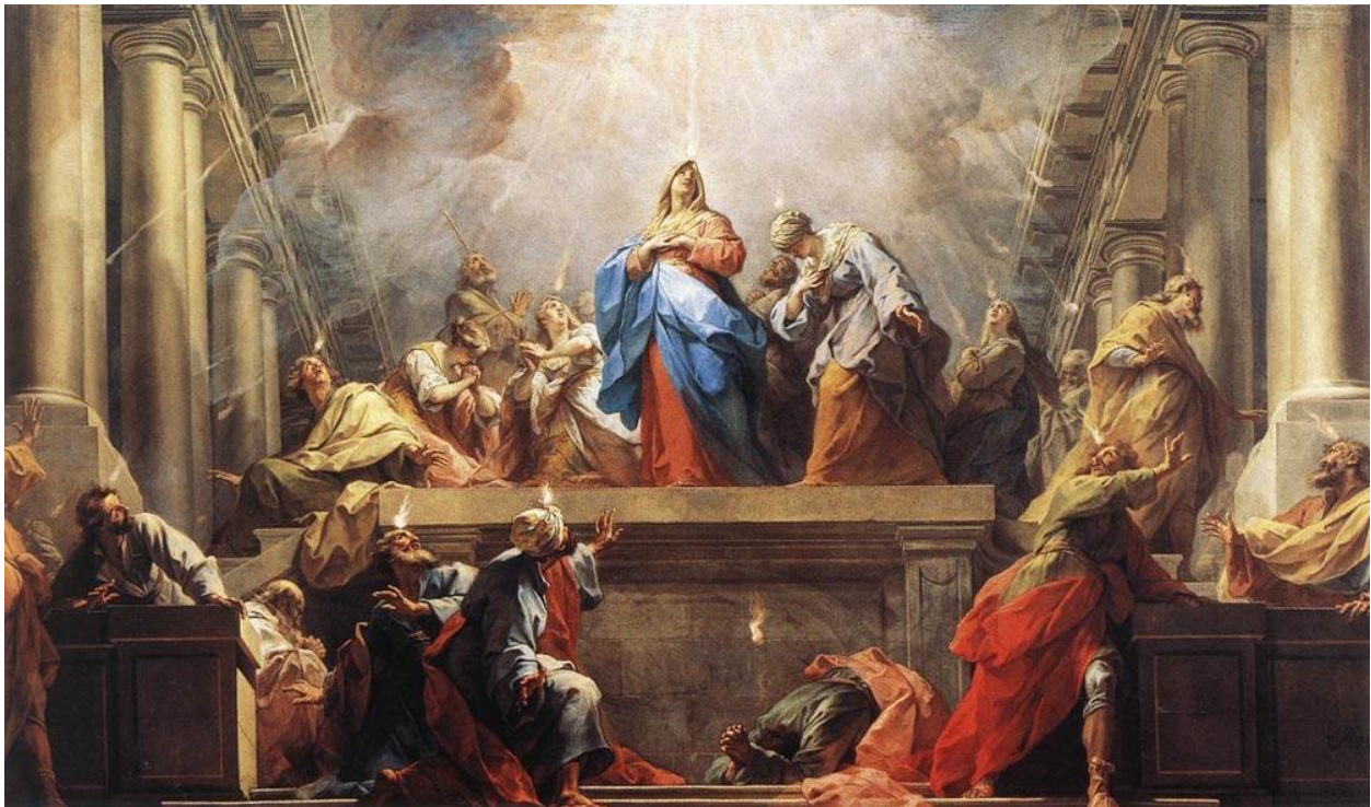
Painting: Pentecost by Jean Restout